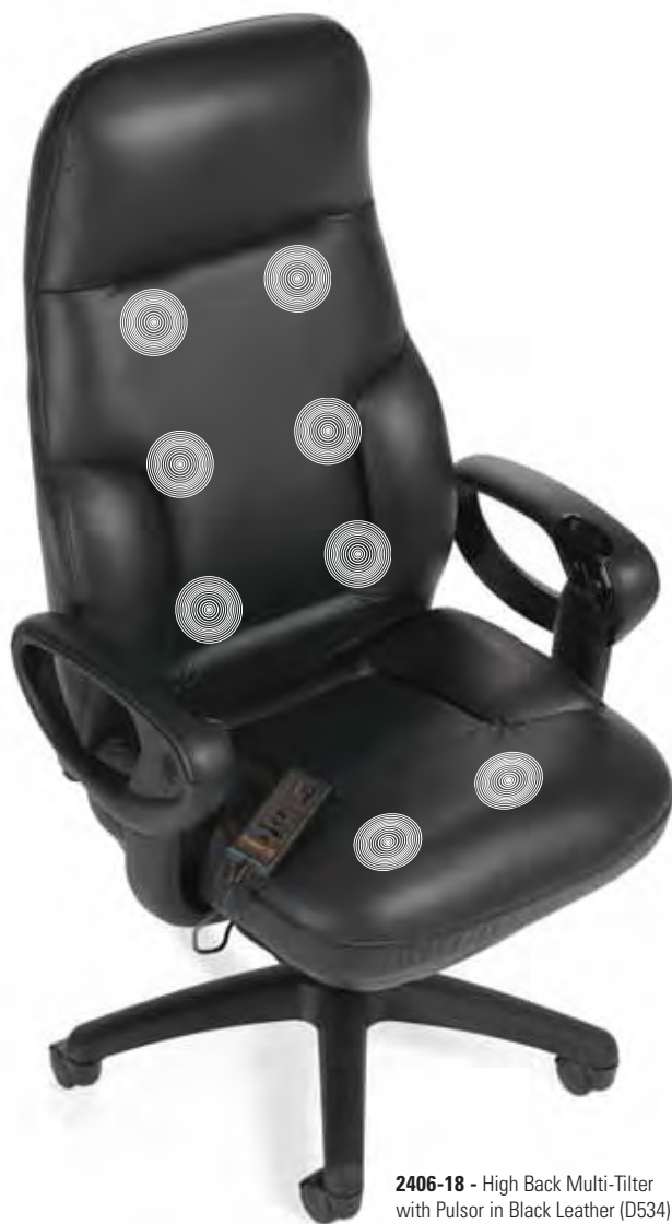
2406-18 - High Back Multi-Tilter with Pulsor in Black Leather (D534)

Concorde executive chairs are available with a built in relaxing system, called Pulsor. This stress reduction system offers four massage zones in the back and thigh areas. An individual zone can be activated or it can be set to alternate from zone to zone. Intensity can also be adjusted. The system helps alleviate back pain and muscle fatigue, reduces stress and improves circulation and productivity.