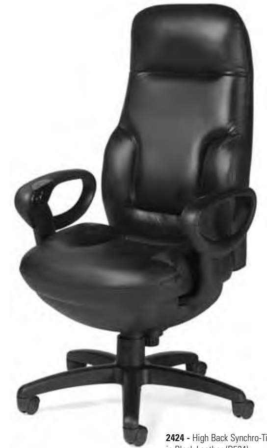
2424 - High Back Synchro-Tilter in Black Leather (D534)