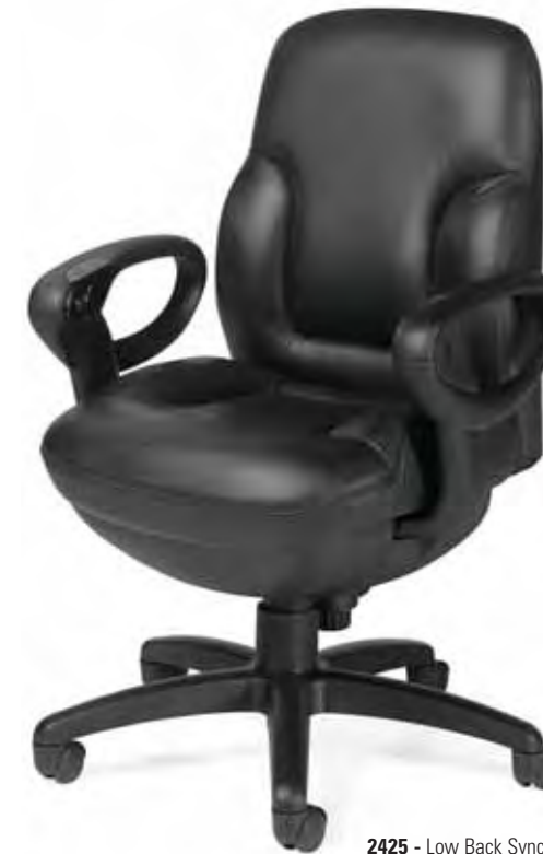
2425 - Low Back Synchro-Tilter in Black Leather (D534)

The 'Executive' represents a new standard in executive seating. Revolutionary push button controls located on the armrest provide state-of-the-art ergonomic adjustment. Exceptional comfort and support are yours in Concorde Executive.