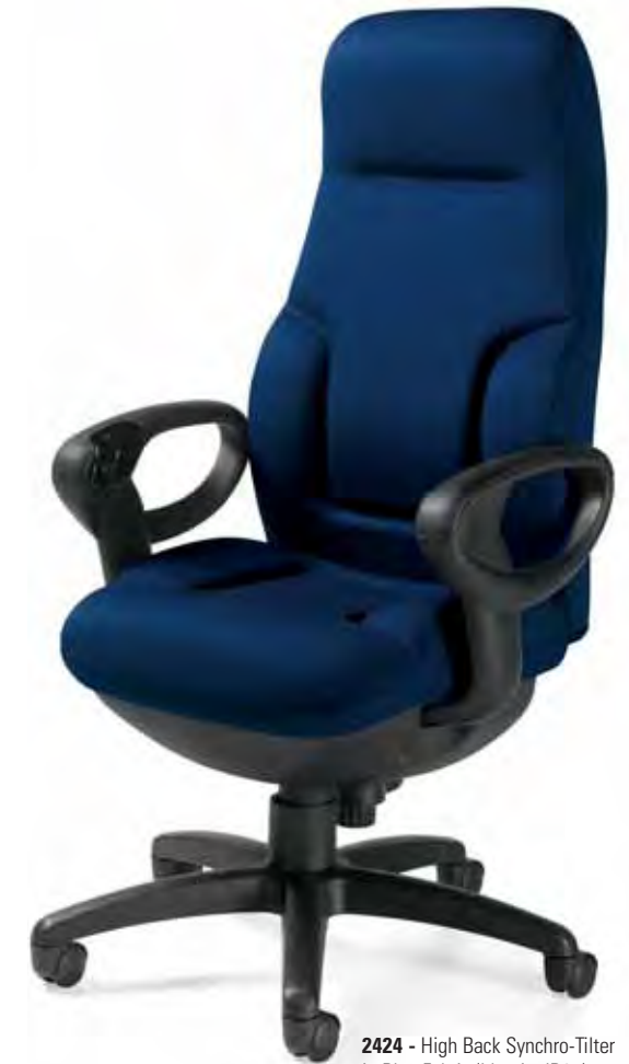
2424 - High Back Synchro-Tilter in Blue Fabric (Identity ID01)

Weight capacity up to 350 lbs even when used in 24-HR applications.