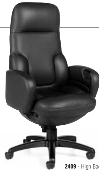
2409 - High Back Synchro-Tilter in Black Leather with optional black base and trim (D534)