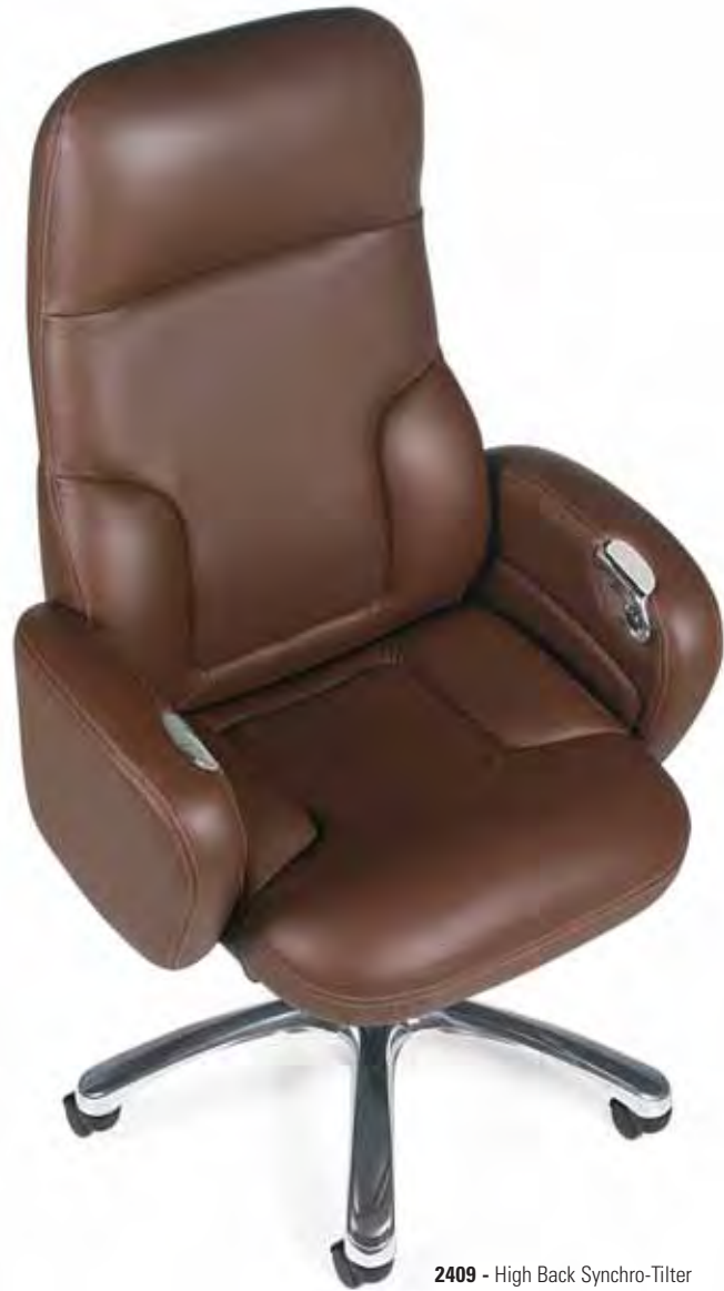
2409 - High Back Synchro-Tilter in Dark Brown Leather (D531)

Offered in Global's most luxurious leathers, Concorde provides the ultimate ergonomic support and comfort for the executive environment.