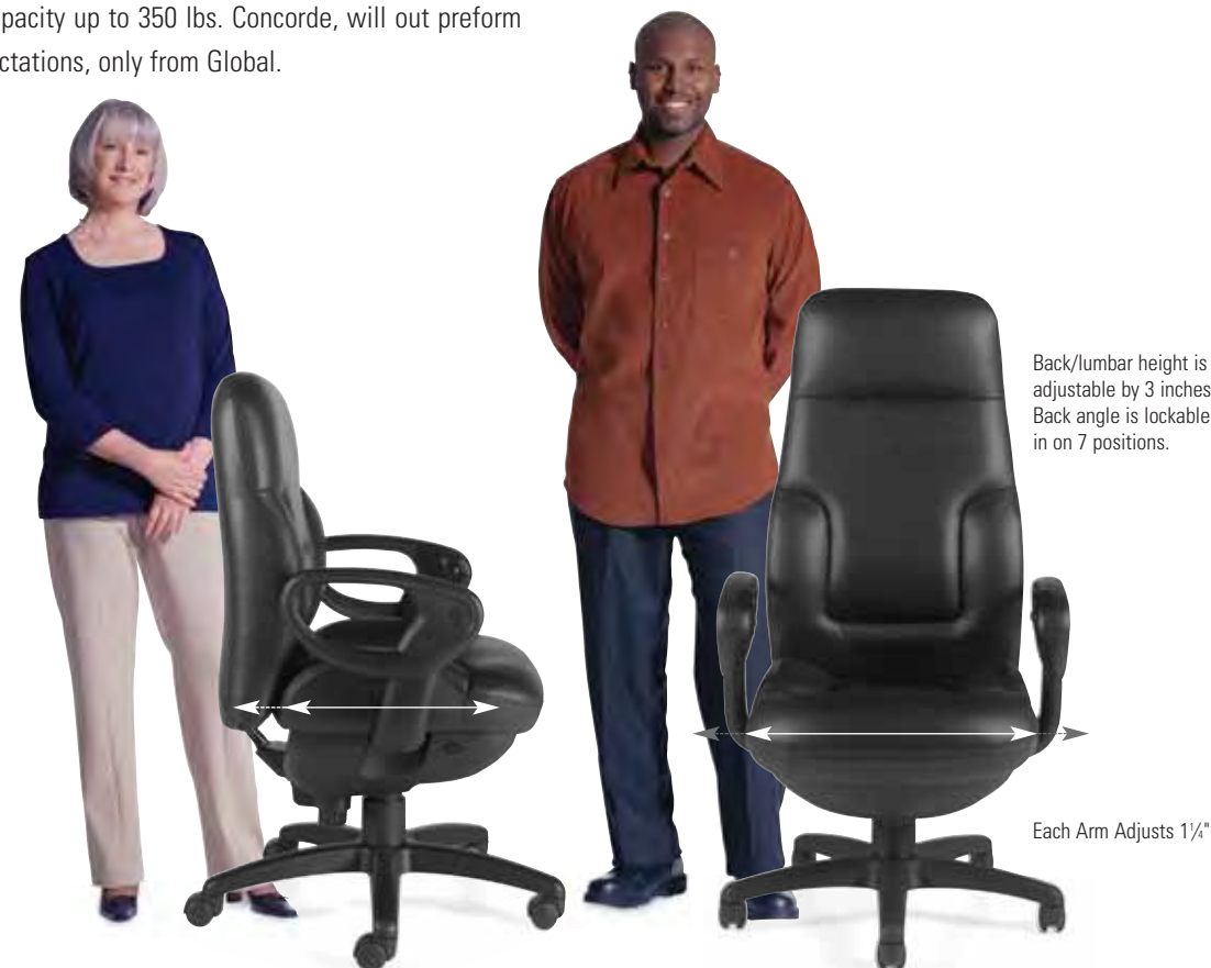
Back/lumbar height is adjustable by 3 inches. Back angle is lockable in on 7 positions.