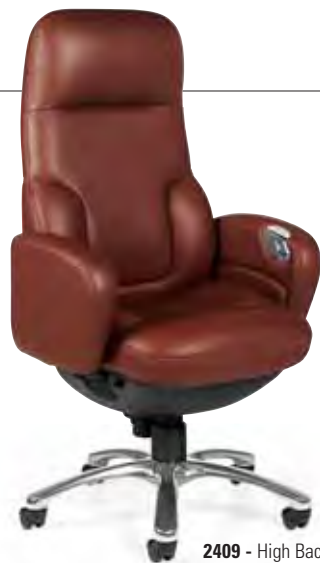
2409 - High Back Synchro-Tilter in Chestnut Leather (D540)