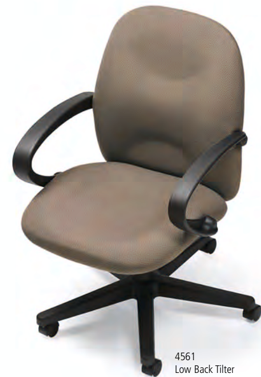
4561 Low Back Tilter