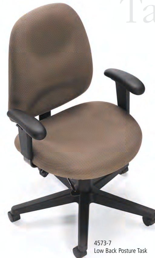
4573-7 Low Back Posture Task