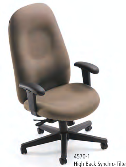
4570-1 High Back Synchro-Tilter