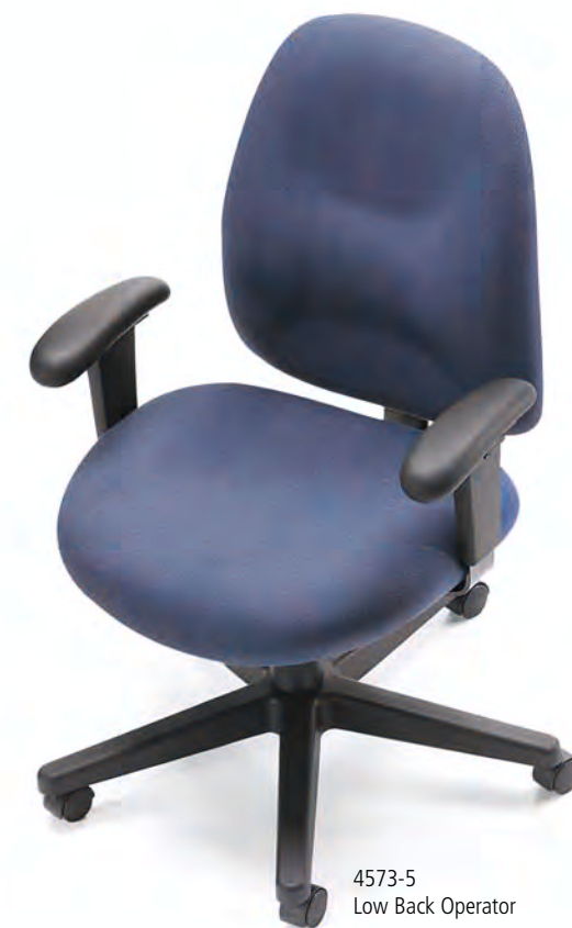
4573-5 Low Back Operator