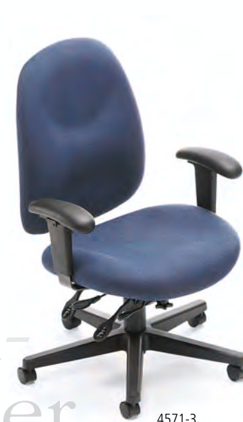
4571-3 Low Back Multi-Tilter