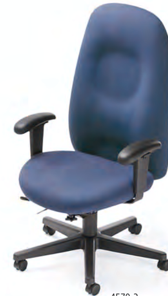
4570-3 High Back Multi-Tilter