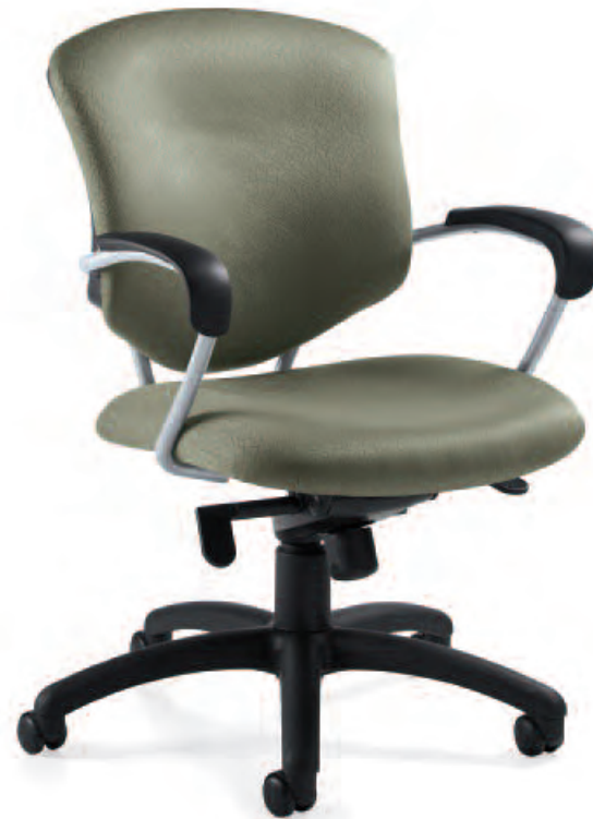
5331-2 Medium Back Knee Tilter shown in Styx ST20 Olive