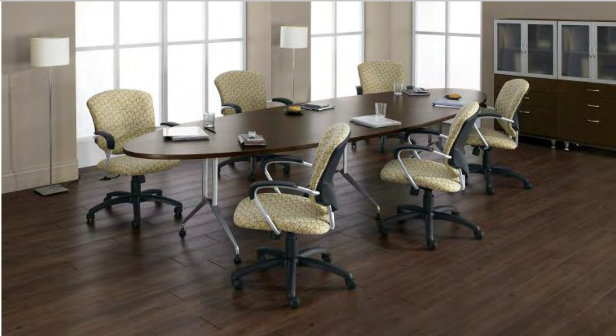
Above: 5331-4 Medium Back Tilter Supra chairs shown with Alba tables. Fabric: Momentum Quantum Beeline (09072457)