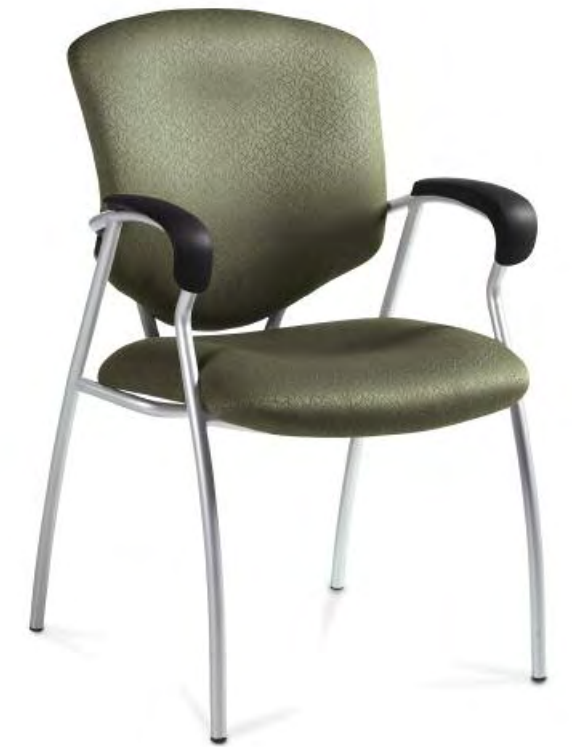
5332 Available in Tungsten (TUN) as shown above or Black (BLK) frames. Armchair shown in Styx ST20 Olive

Contoured cushions support the user in comfortable, contemporary style. Supra is available with a standard black fiberglass reinforced nylon base or an optional Tungsten (TUN) finished steel base. An armchair is available with casters for easy mobility. Value, beauty and comfort all in one chair. Designed by Zooney Chu.