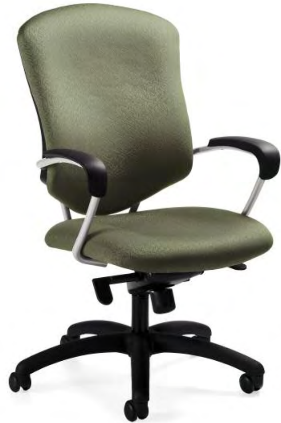
5330-2 High Back Knee Tilter shown in Styx ST20 Olive