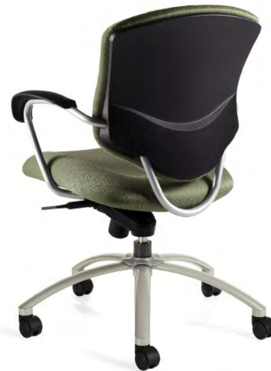
5331-2 Medium Back Knee Tilter shown in Styx ST20 Olive with Tungsten base